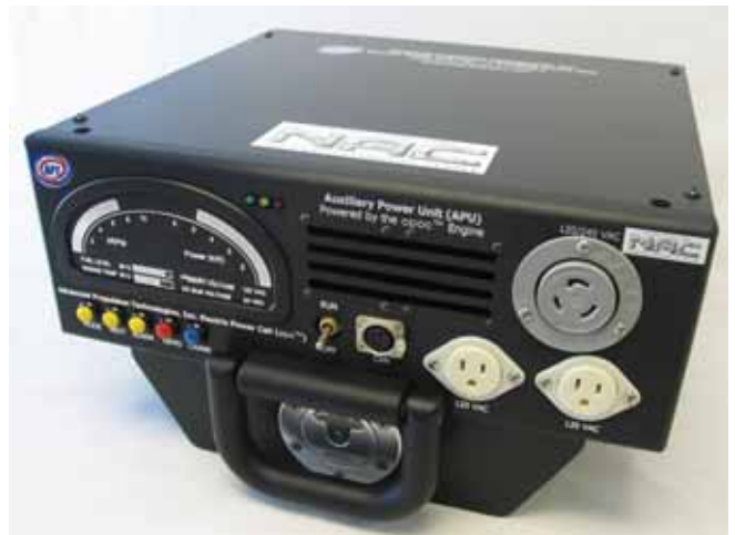
Designed by Advanced Propulsion Technologies, this briefcase-size 5-kW generator has five times the power density of a conventional generator. The portable auxiliary power unit is appropriate for delivering in-vehicle power as well as plug-in exportable power.