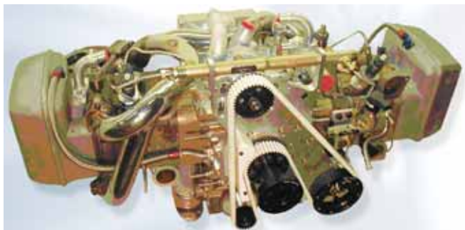
Typical components like the cylinder head, valves, and camshafts are eliminated in the OPOC engine design for enhanced scalability, whereby the addition of a self-contained module can increase peak power and torque.

"As we like to say, if a soldier shoots it, drives it, flies it, wears it, or eats it, the Army Materiel Command provides it," General Benjamin Griffin, Commanding General of the U.S. Army Materiel Command, said during a keynote speech on the